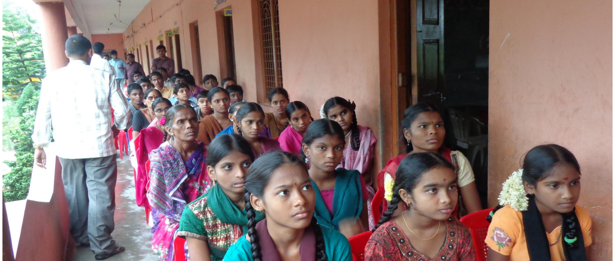
Photo Gallery -1 Children being interviewed & Distribution of Books & Stationary (27 th Oct 2013)